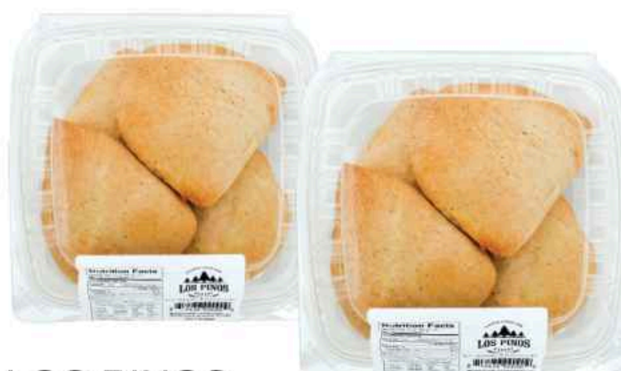
LOS PINOS EMPANADAS select varieties 4 ct.