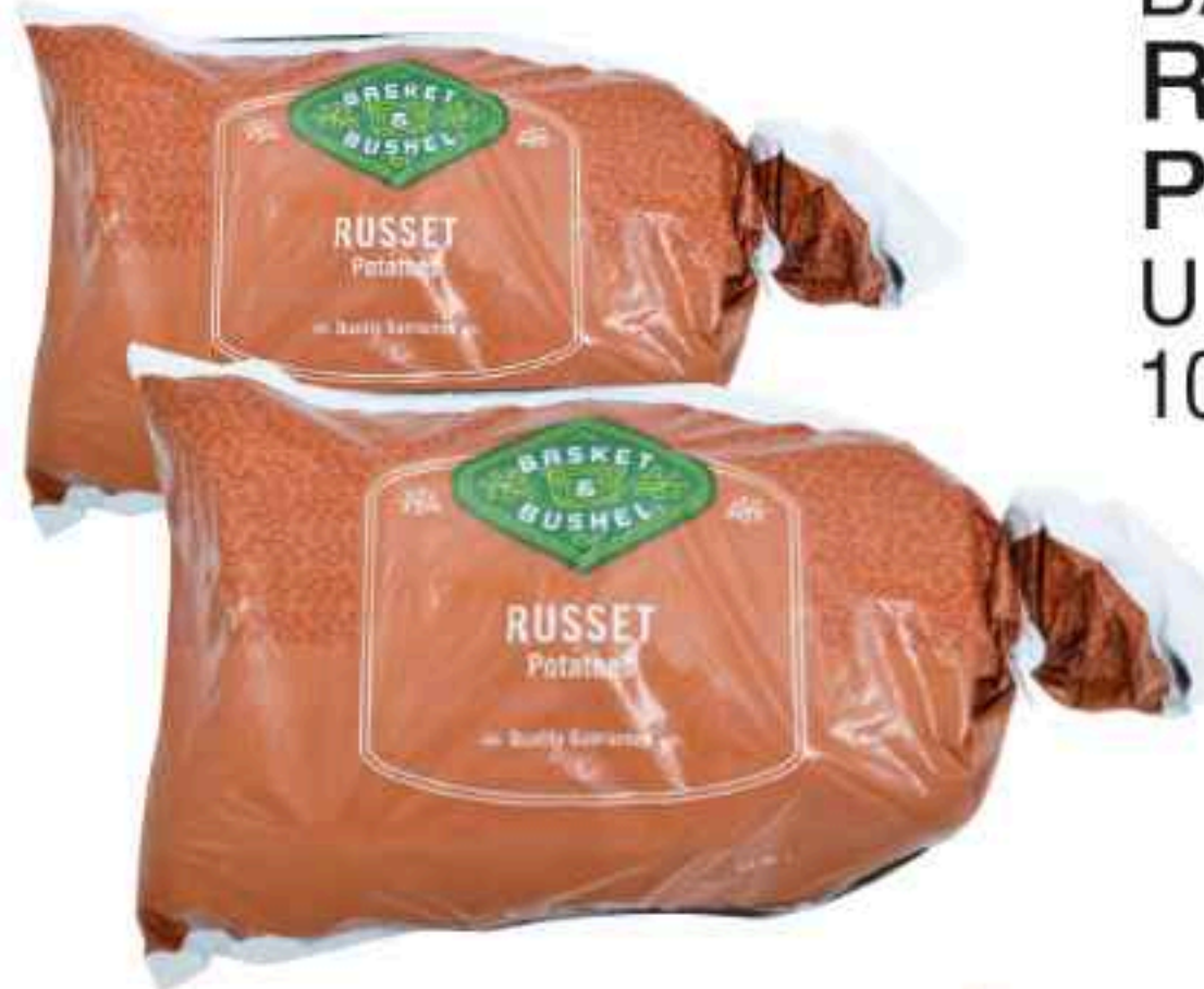
BASKET & BUSHEL RUSSET POTATOES U.S. #1 10 lb. bag