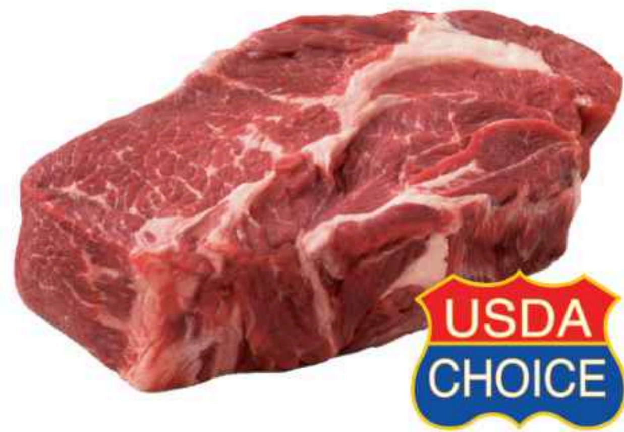
CHOICE BEEF CHUCK ROAST boneless