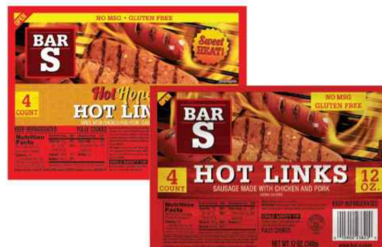
BAR S HOT LINKS regular or hot honey 12 oz.