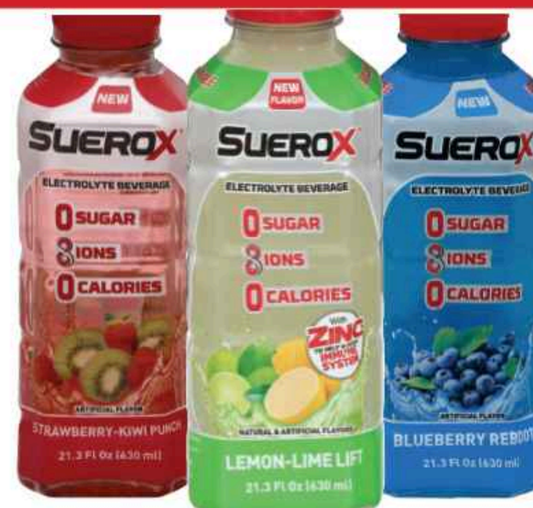
SUERO-X ELECTROLYTE BEVERAGE select varieties 21.3 oz.