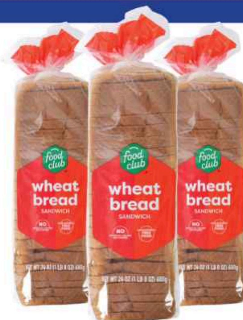
FOOD CLUB SANDWICH WHEAT BREAD 24 oz.