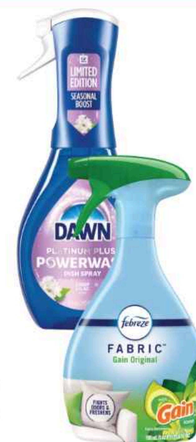
FEBREEZE FABRIC REFRESHER select varieties 23.6 oz; or DAWN PLATINUM PLUS POWERWASH DISH SPRAY 16 oz.