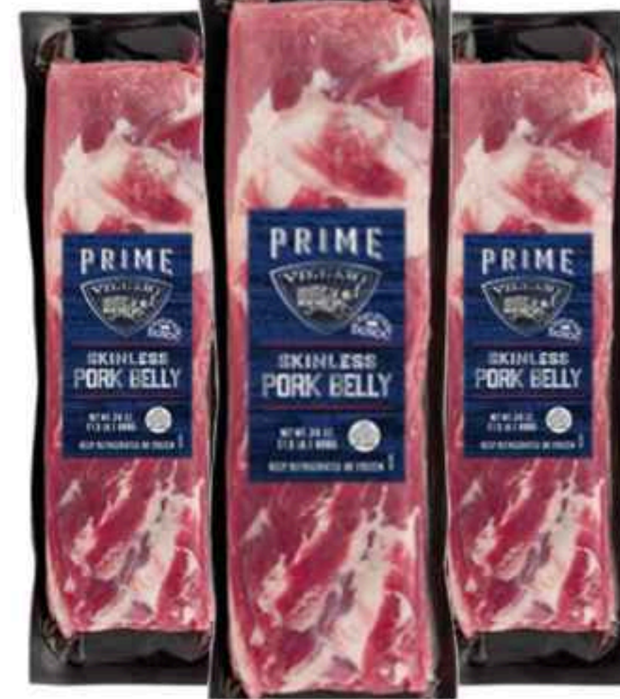
PRIME VILLARI SKINLESS PORK BELLY 24 oz.