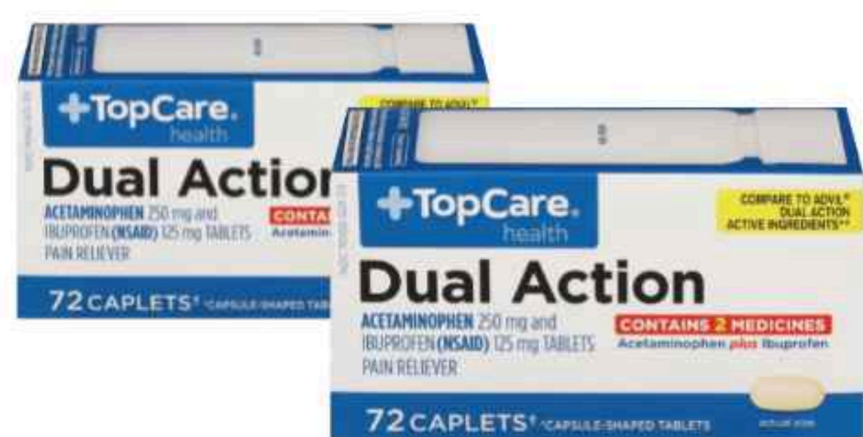
TOPCARE DUAL ACTION acetaminophen & ibuprofen 72 ct.