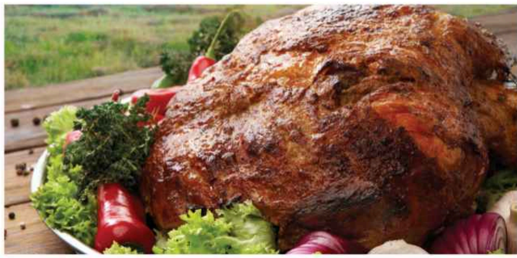
"BOSTON BUTT" PORK ROAST fresh