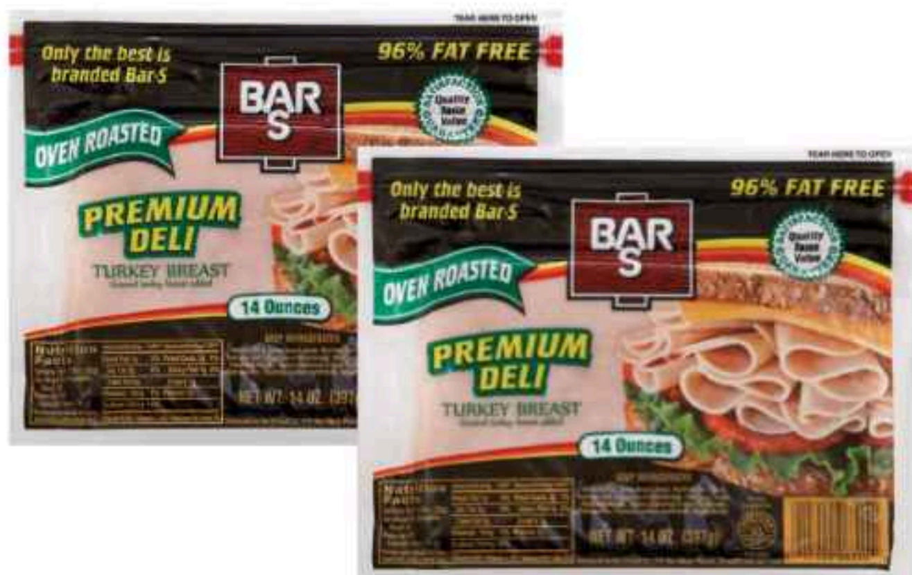
BAR S PREMIUM DELI OVEN ROASTED TURKEY BREAST 14 oz.