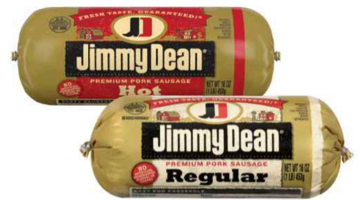
JIMMY DEAN PREMIUM PORK SAUSAGE select varieties 1 lb. roll