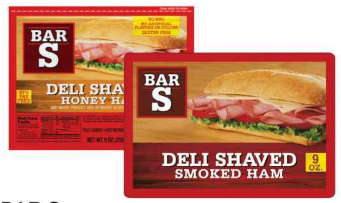
BAR S DELI SHAVED HAM select varieties 9 oz.