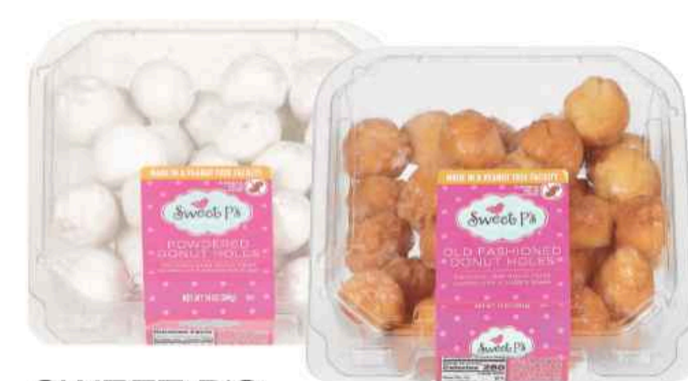
SWEET P'S DONUT HOLES select varieties 12-14 oz.