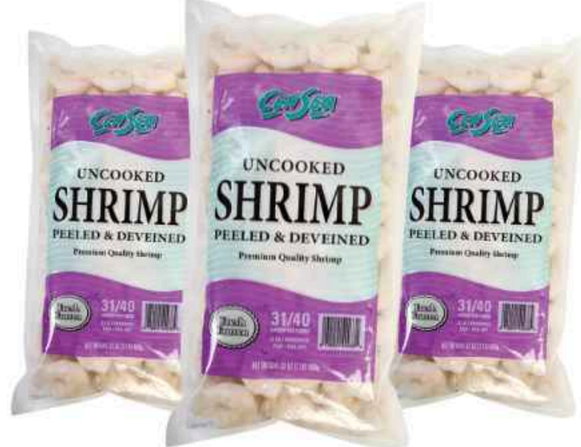
CENSEA RAW SHRIMP p&d tail off 31/40 ct. sold in a 2 lb. bag for $15.98