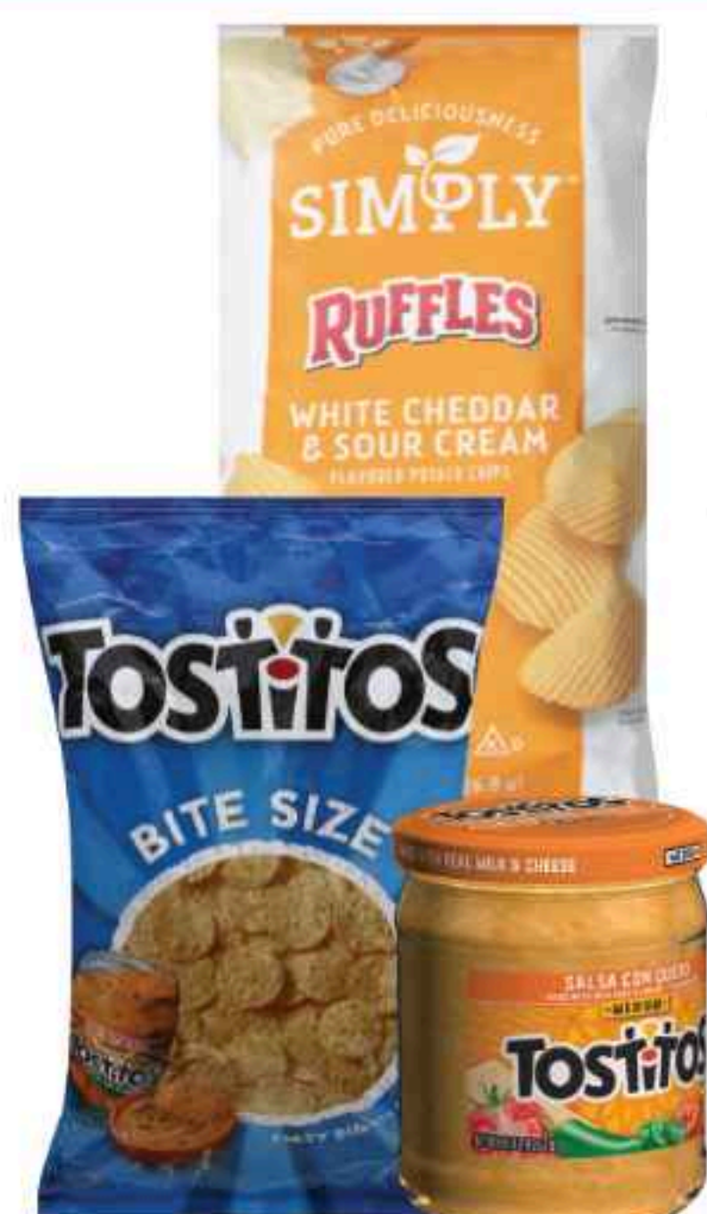
FRITO LAY TOSTITOS OR SIMPLY CHIPS select varieties reg. $3.99-$5.49; or