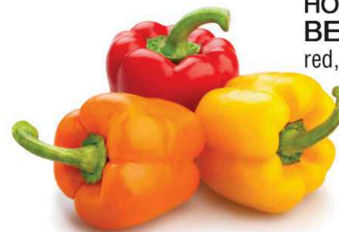
HOTHOUSE BELL PEPPERS red, orange or yellow