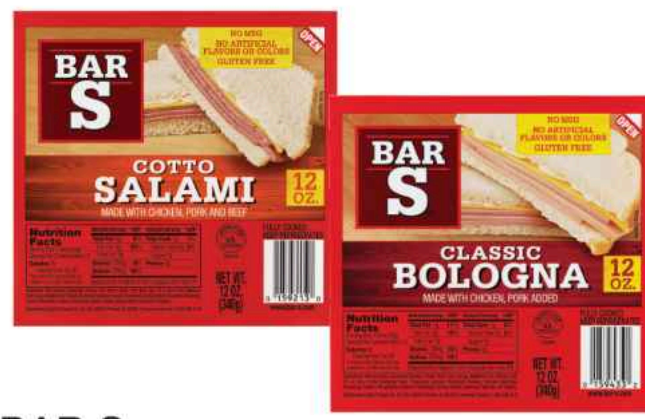
BAR S COTTO SALAMI OR BOLOGNA select varieties 12 oz.