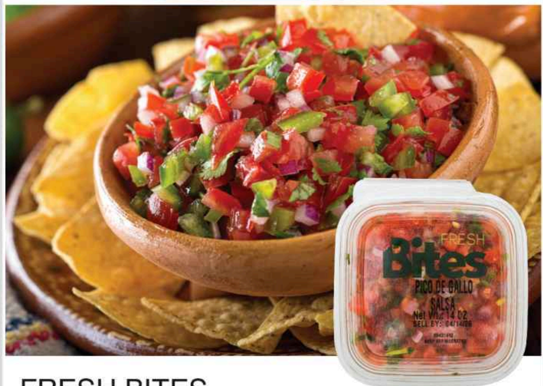
FRESH BITES PICO DE GALLO 14 oz.