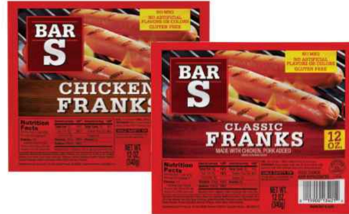
BAR S CHICKEN OR MEAT FRANKS select varieties 12 oz.