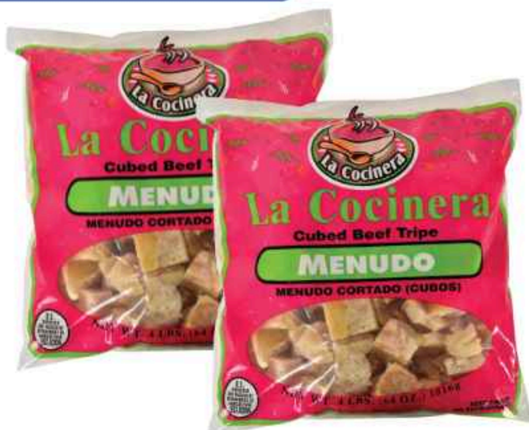
LA COCINERA MENUDO cubed beef tripe 4 lb. bag