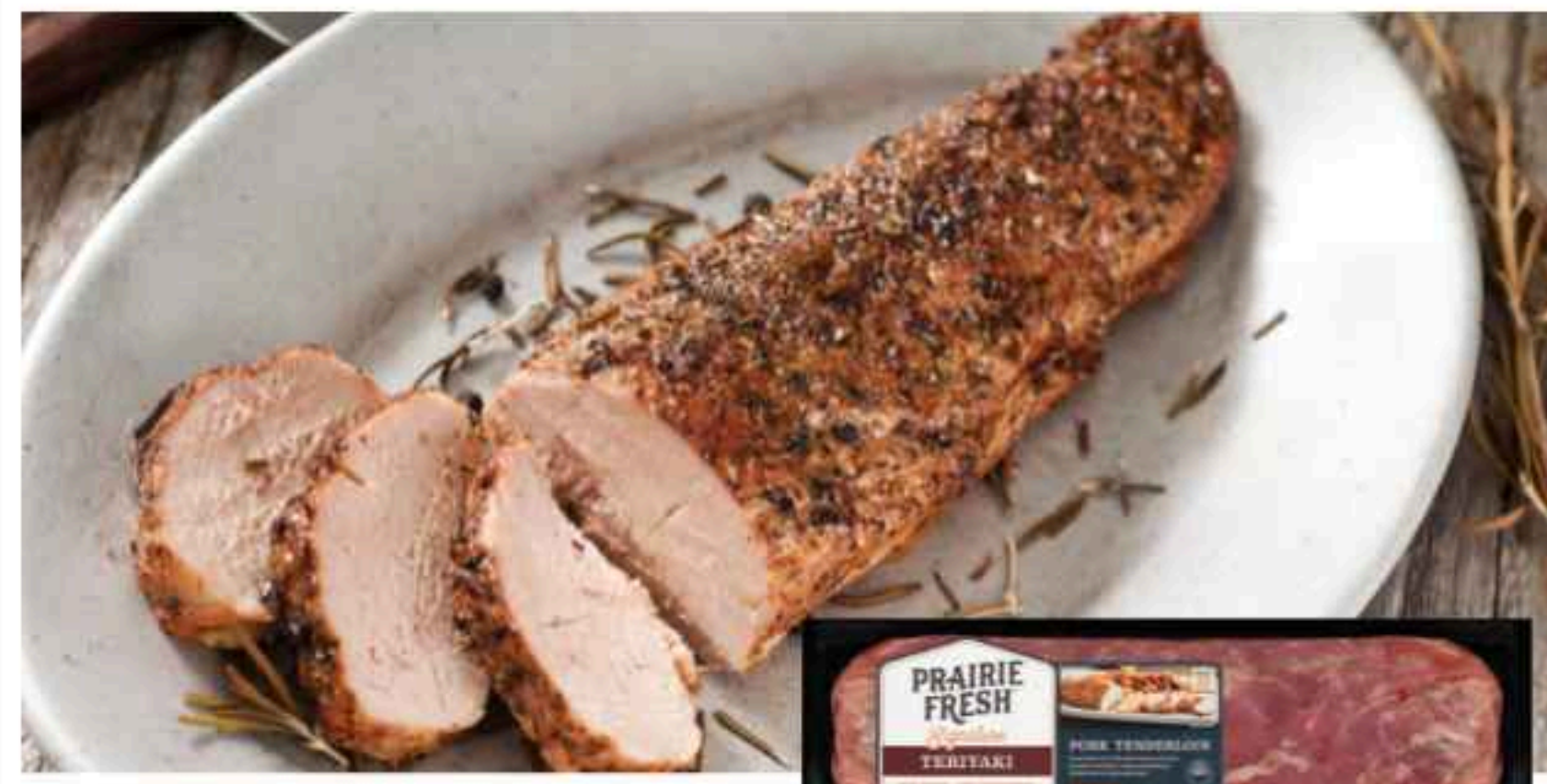
PRAIRIE FRESH MARINATED PORK TENDERLOINS teriyaki or rotisserie 18.4 oz.