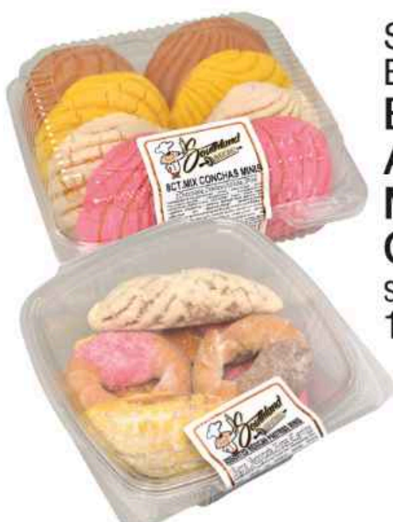
SOUTHLAND BAKING CO. BOLILLO ROLLS, ASSORTED MINI PASTRIES, OR CONCHAS select varieties 12 oz. or 12 ct.