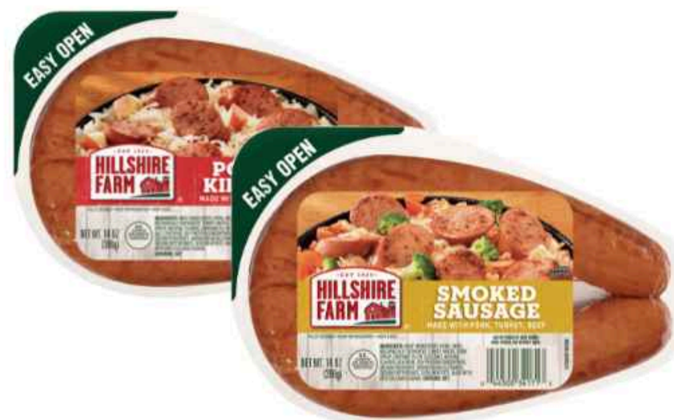
HILLSHIRE FARM SMOKED SAUSAGE select varieties 13-14 oz.