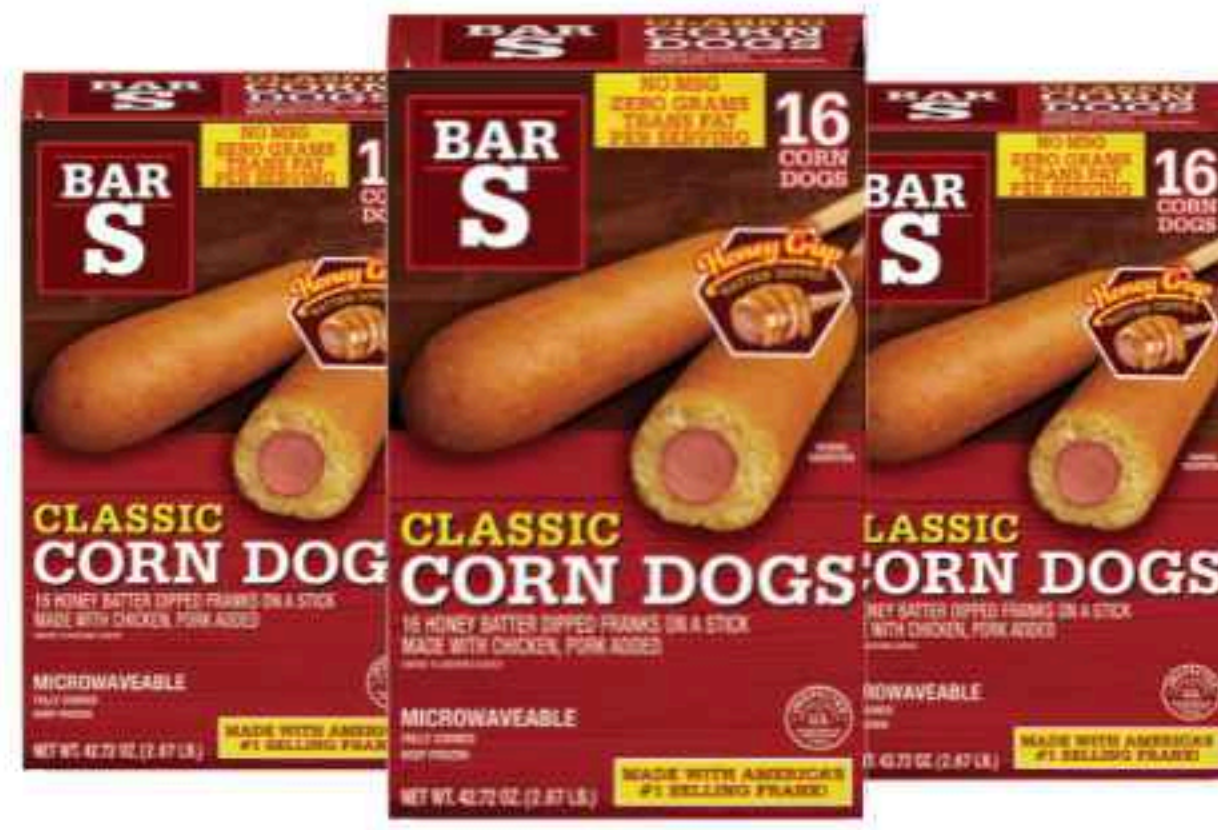
BAR S CLASSIC CORN DOGS 2.67 lb. box