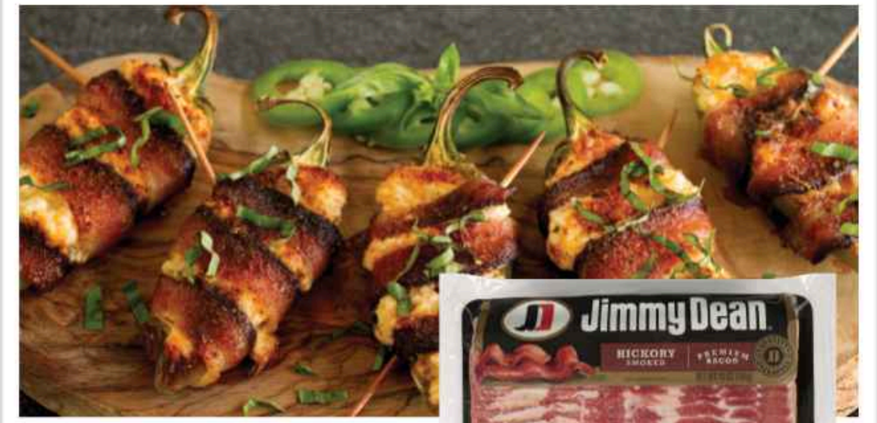
JIMMY DEAN BACON hickory or applewood 12 oz.