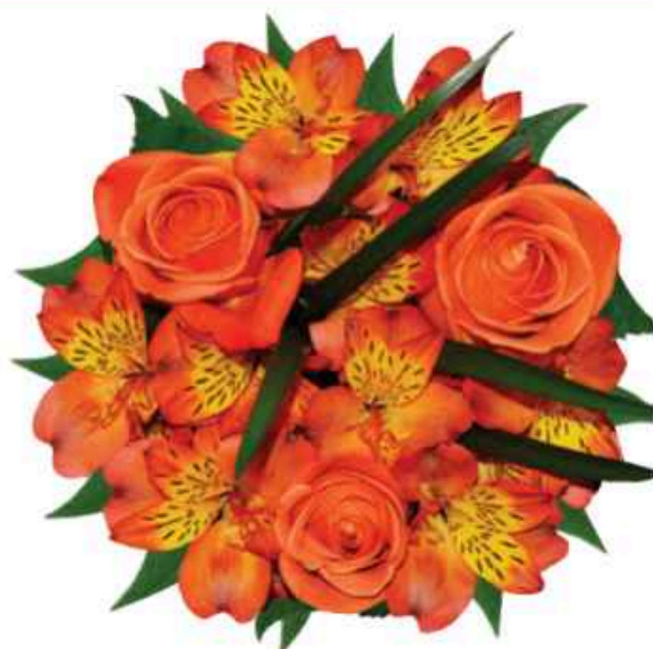
MONOCHROMATIC ROSE ALSTRO BOUQUET $8 99 ea.