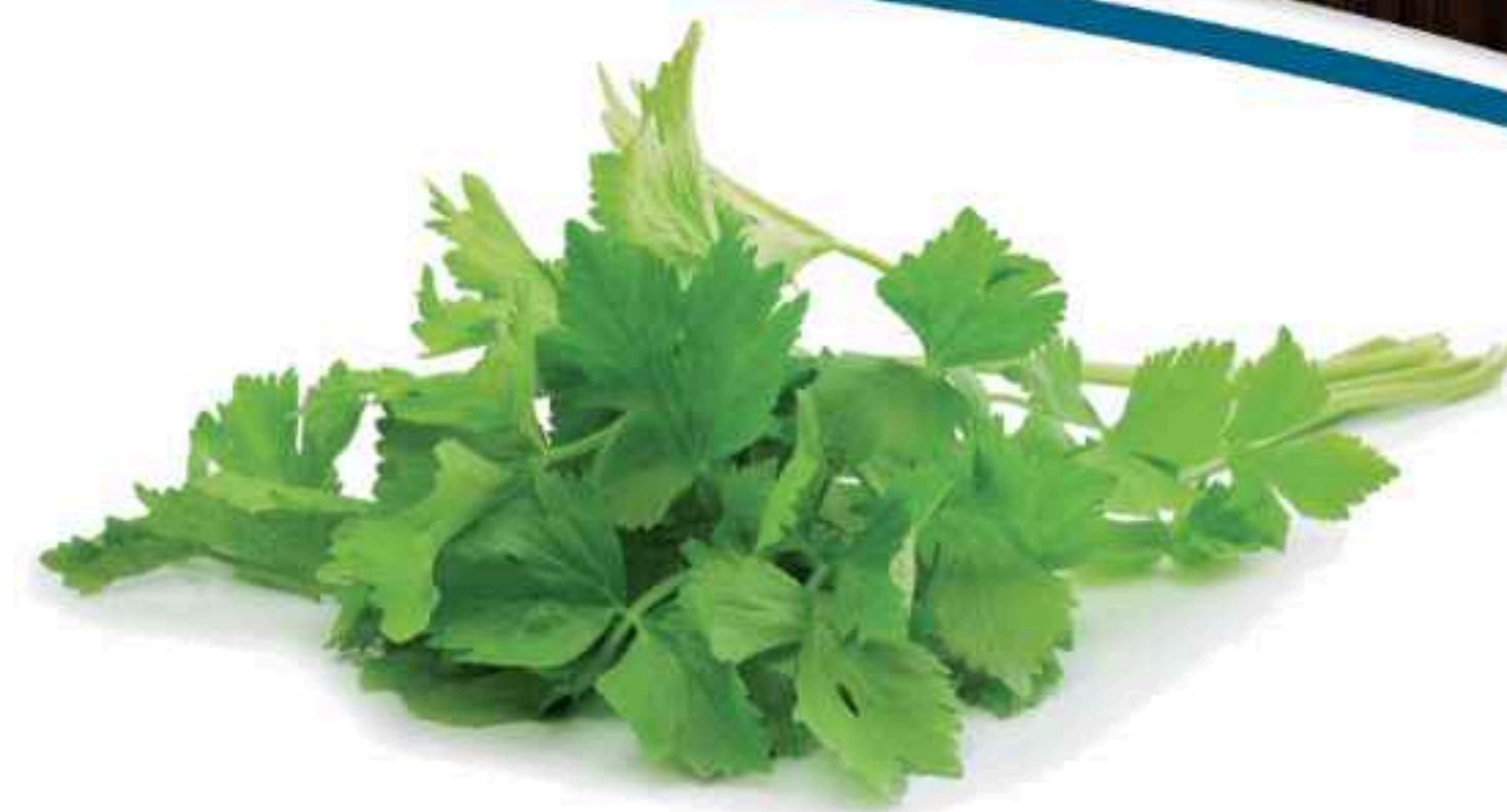
FRESH BUNCH CILANTRO