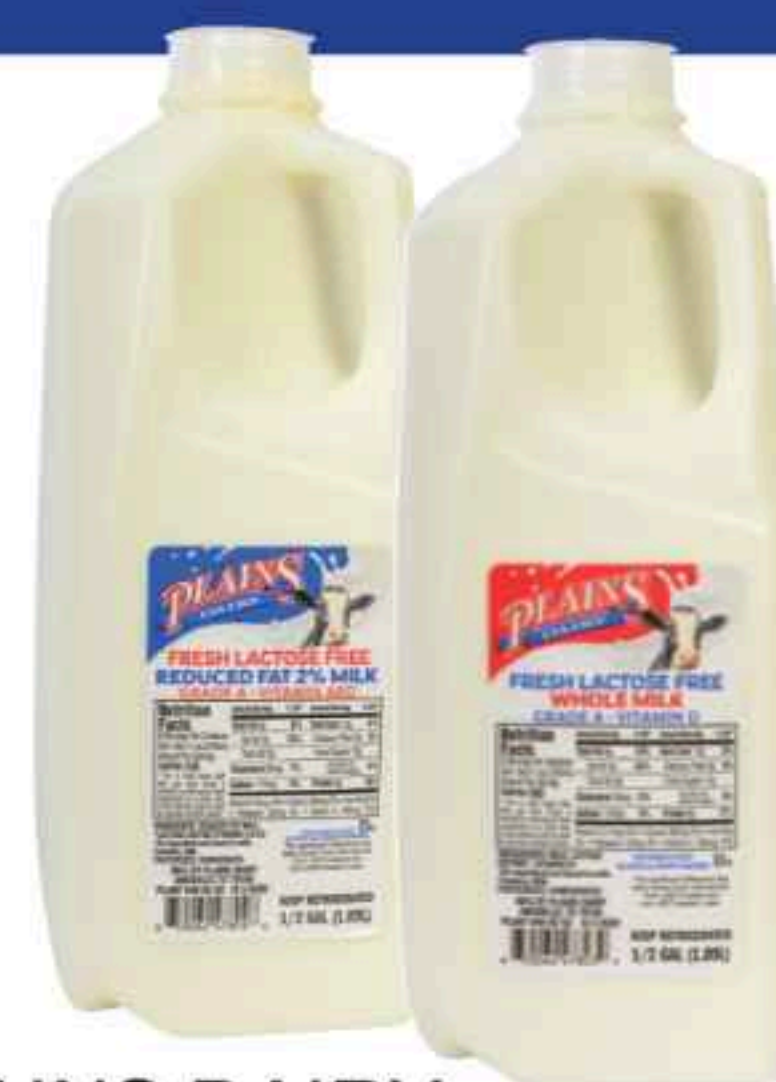
PLAINS DAIRY FRESH LACTOSE FREE MILK whole or reduced fat 2% 64 oz.