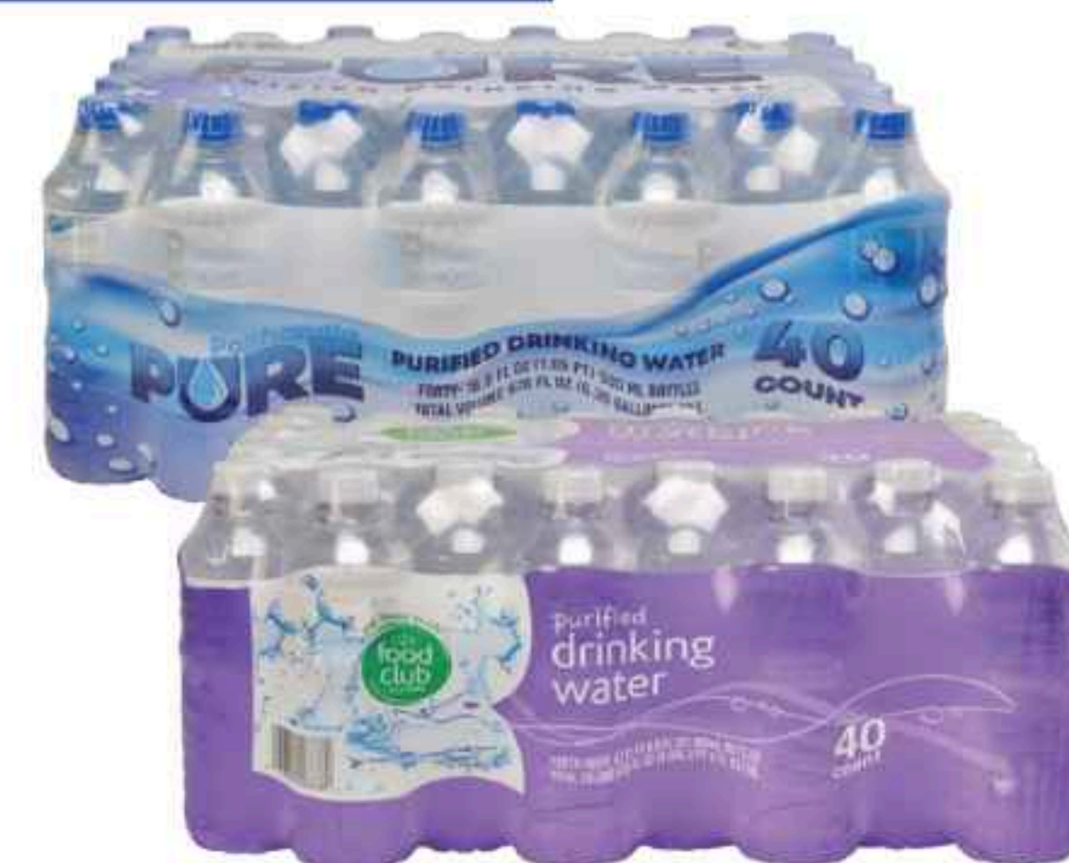
FOOD CLUB OR PANHANDLE PURE DRINKING WATER 40 pack 16.9 oz. btl.