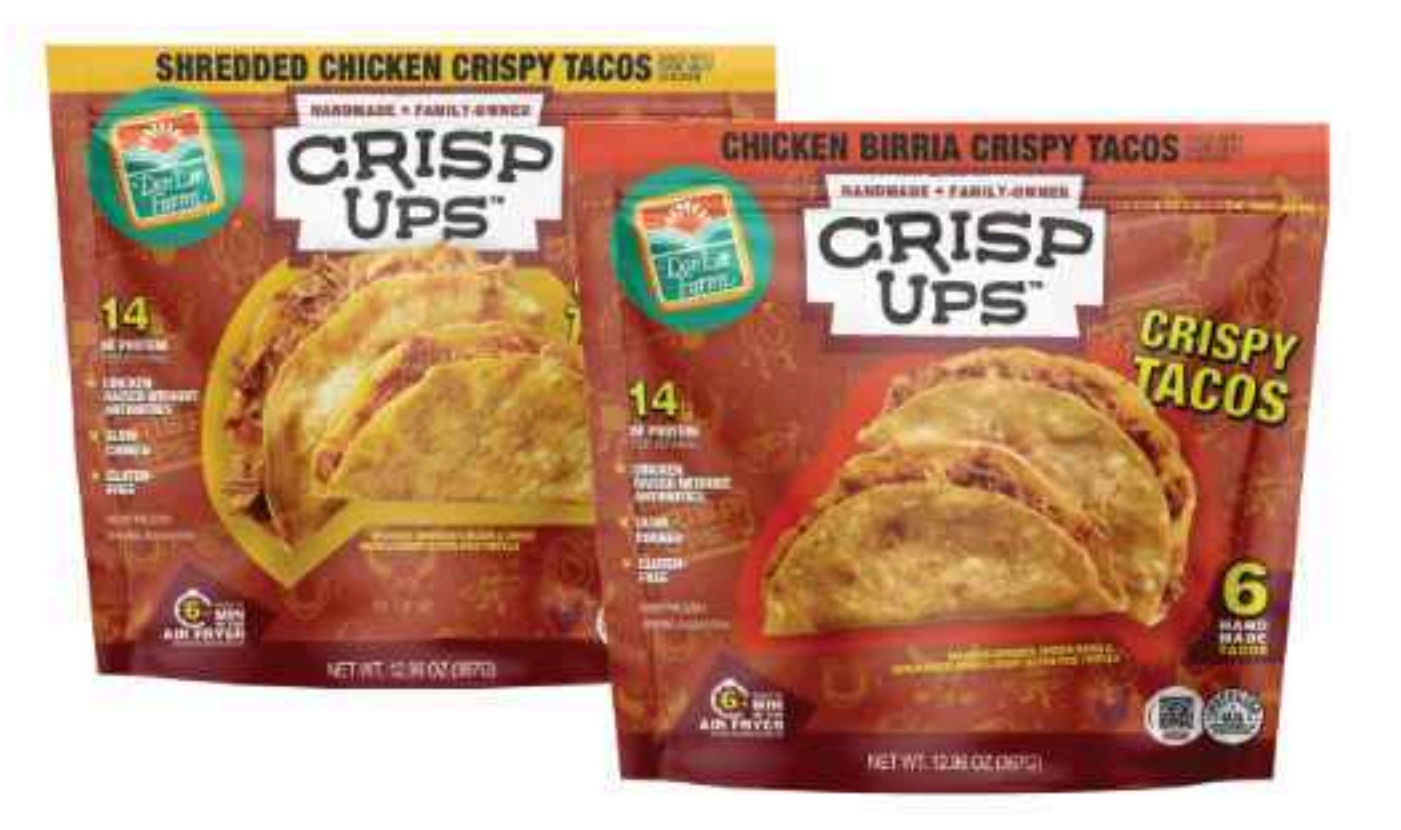
DON LEE FARMS CRISP UPS CRISPY TACOS select varieties 8.96-12.96 oz.